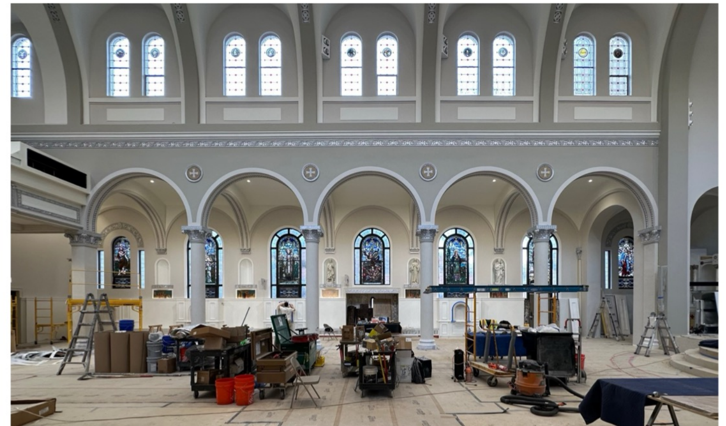
Works 'before' and in progress Shrine of Our Lady of Pompeii, Chicago